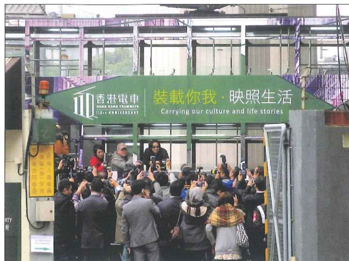
Left: Three celebrities (left to right in the tram), Ms. Cecilia Yip (葉童), Mr. Anthony Wong (黃秋生) and Mr. Teddy Robin (泰迪羅賓) encircled by the media on 18th February 2014, sharing stories of 'Ding Ding' on tram 110.